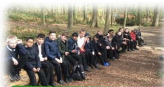
AVON AND TWEED CLASS TRIP